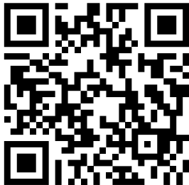
Project Facebook Page

The Open Government Steering Committee (OGSC) has the capacity to enable discussions and propose the following steps for this agenda of collective action to enhance and improve public policies and citizen services. These commitments cannot be carried out without an adequate roadmap that pinpoints the implementation strategy for each of them to become a reality. Without a doubt, it is an ambitious plan, but with proper planning led by the government, and accompanied by the entire open government ecosystem, it can become a reality.